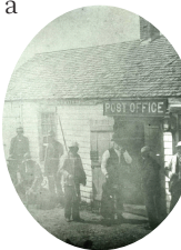
Squibnocket Post Office. ▲