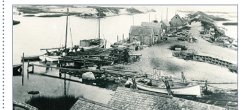
▲ Menemsha Harbor