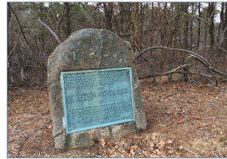
▲ Abel's Hill Cemetery

Until the early 1900s, the village center of Chilmark stood at these crossroads. Deaf residents of the town would have come here to worship at the Congregational and Methodist Churches, do business or socialize at one of the two general stores, or attend meetings at the Town Hall. The roads that converge here all date to the 1700s. Most deaf citizens of Chilmark would have spent their lives on widely scattered farms like those that, even today, border Middle Road.