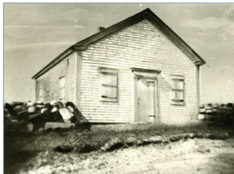
▲ Chilmark Town Hall