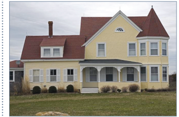
▲ Mayhew House