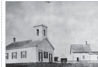
▼ Chilmark School

E. Elliot Mayhew moved his general store, which doubled as the post office, to the site of the current Chilmark Store. A new town hall, still in use today, was built on the Middle Road side of the intersection in 1887, and the Methodist church (now the Chilmark Community Church) moved to the Menemsha Crossroad in 1910. These changes completed the shift of Chilmark's village center from its old location (Stop #4) to its current one.