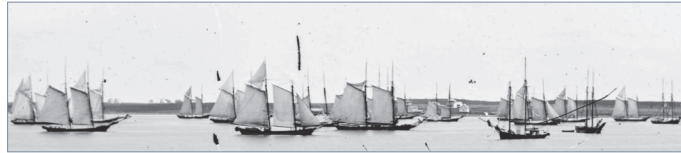
▲ Vineyard Haven Harborfront. Circa 1900.